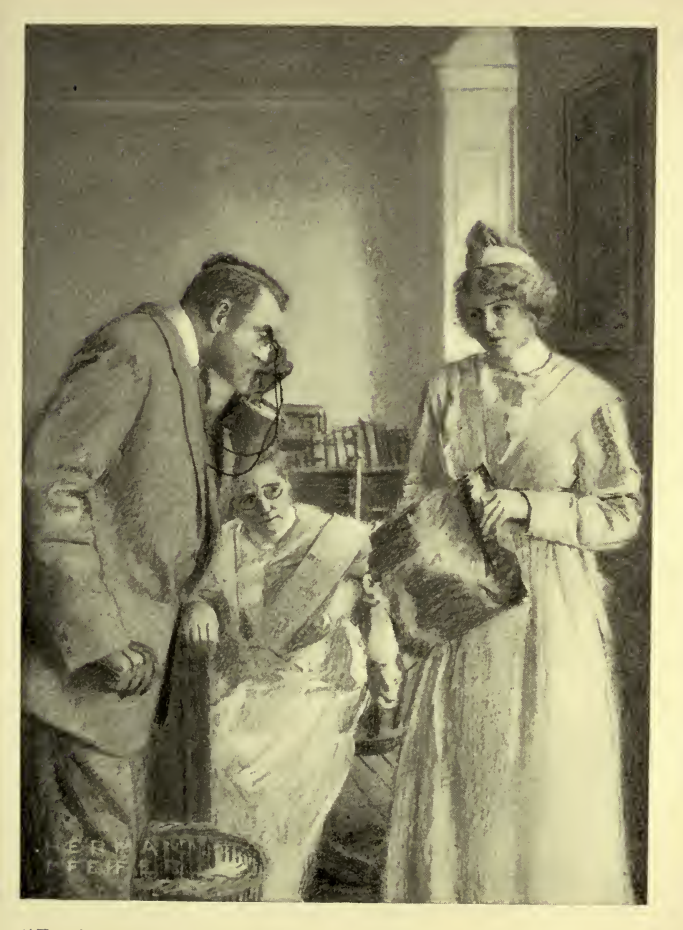
"Don't ever be bumptious?" squinted the Senior Surgeon perplexedly through his glasses.